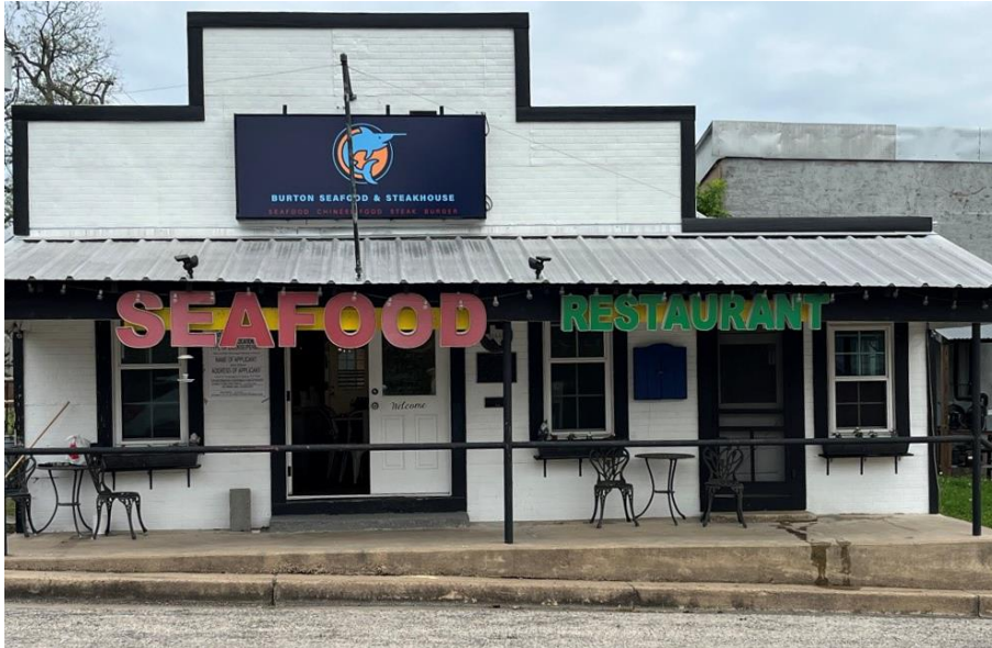
Burton Seafood & Steakhouse